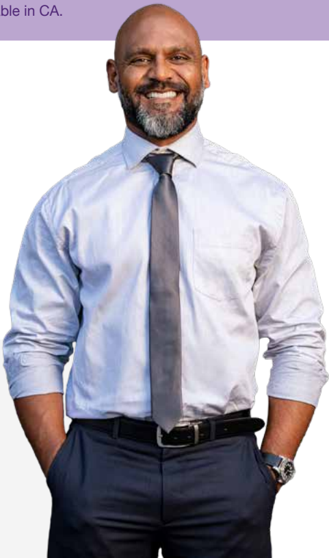
Fixed Indexed Universal Life Insurance Basics

When you receive the policy, read it carefully. Ask your financial or insurance professional about anything that’s not clear to you and the benefits and restrictions that apply in your state.